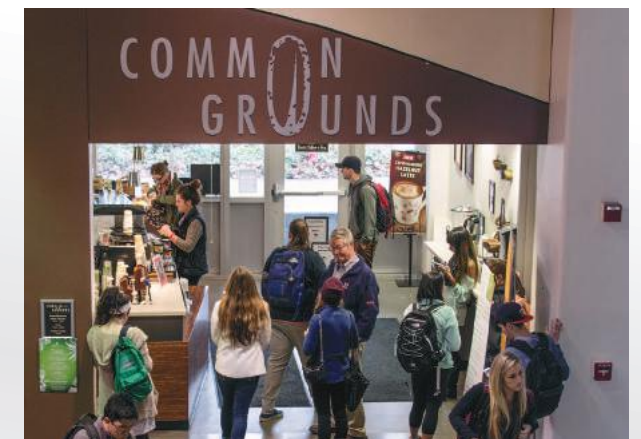
Located in the BMU, Common Grounds is a popular café where students can use their FLEX Cash or ReDD money.

You are not required to have a meal plan to purchase ReDD$ and there is no expiration, so ReDD$ rolls over every semester and every school year until you graduate!